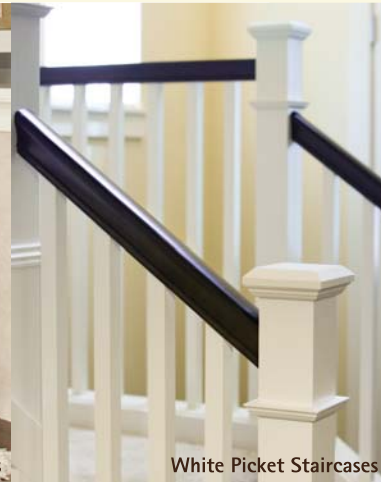
White Picket Staircases