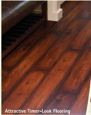
Attractive Timber-Look Flooring