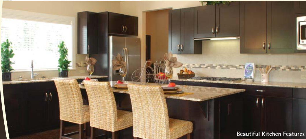
Beautiful Kitchen Features