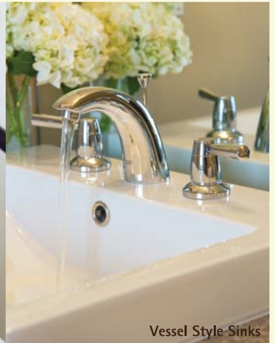
Vessel Style Sinks