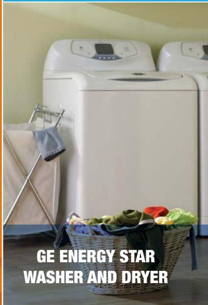
GE ENERGY STAR WASHER AND DRYER