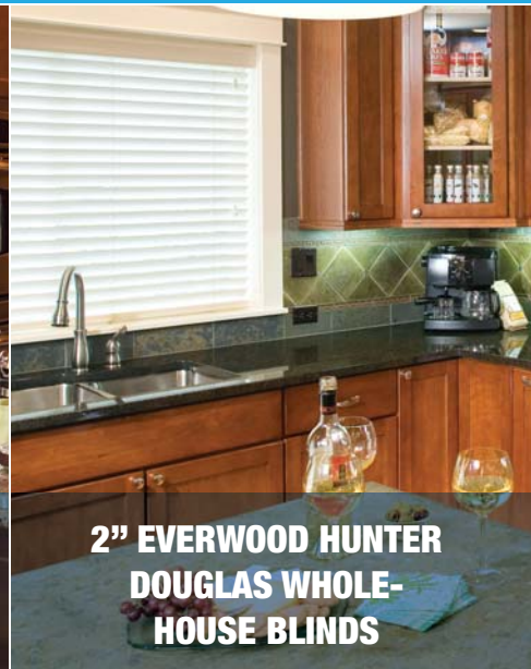
2" EVERWOOD HUNTER DOUGLAS WHOLE- HOUSE BLINDS